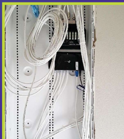
Inside your smart panel