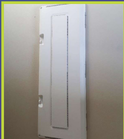
This is your smart panel

You'll find the main feed in your smart panel, located in your upstairs laundry room. The Astound connection has a label tag and a blue "boot" to identify it.