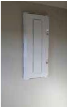
This is your smart panel

You'll find the main feed in your smart panel, located in your upstairs laundry room. The Astound connection has a label tag and a blue "boot" to identify it.