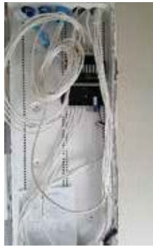
Inside your smart panel